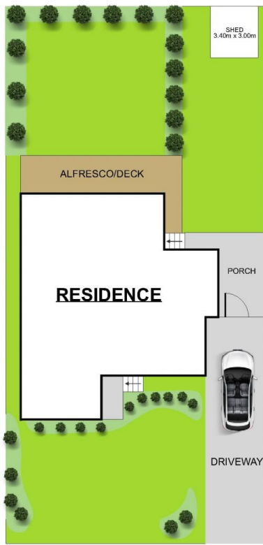
Site Plan Not On Scale